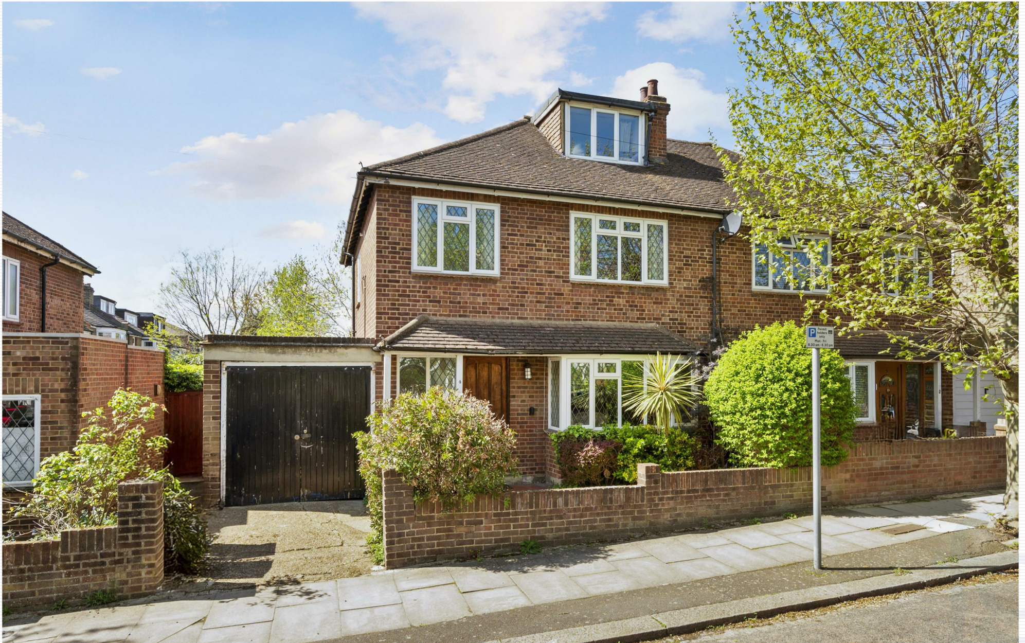
Albert Grove, Wimbledon, SW20 8PY